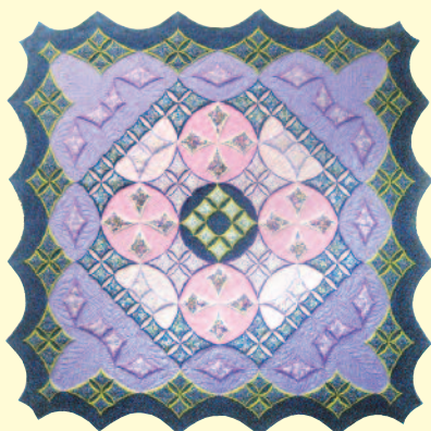
Above: 'Moonlit Garden' by Vendulka Battais