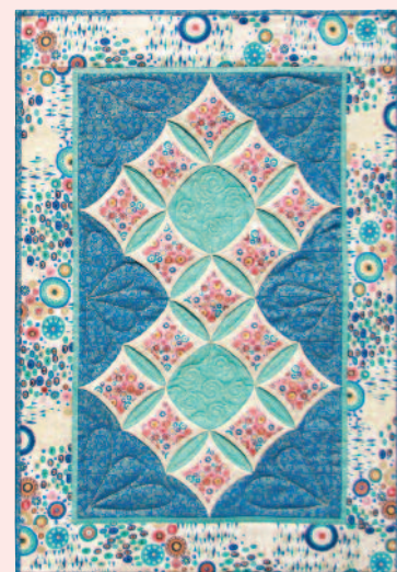
Above: 'Double Wreath' by Vendulka Battais