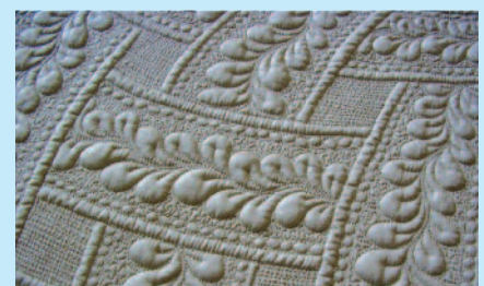
Above: Detail of 'Infinity' by Sandy Chandler