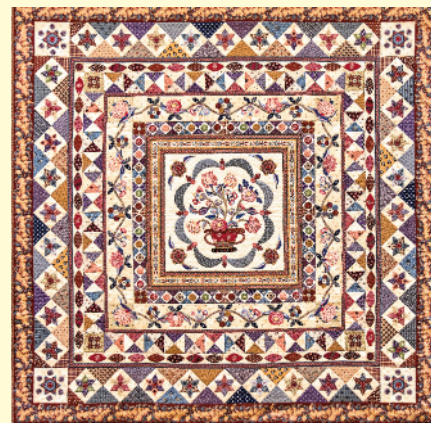
Above: 'Mountmellick' by Hazel Morton (Little Coxwell)