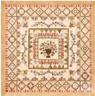
Above: 'Gentle Flowers' by Celia Knight (Little Coxwell)